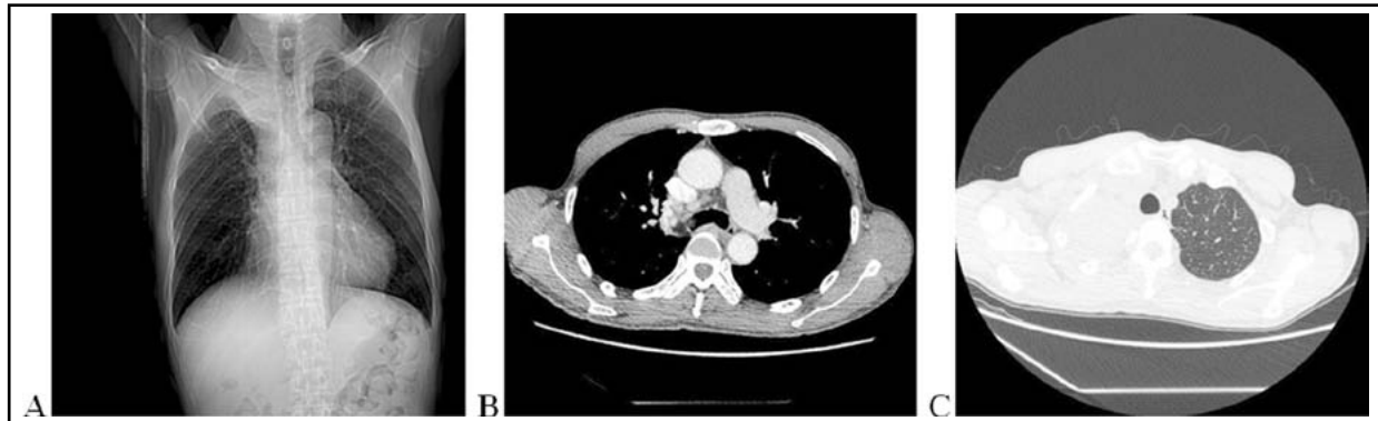
Fig.1. (A) Anterior-posterior chest X-ray showing atelectasis of the right upper lung. (B) Chest-computed tomography (CT) showing an extra-bronchial extension of tumor with low attenuation suggesting a fat containing lesion.

(C) CT of the chest showing complete atelectasis of the right upper lobe secondary to bronchial obstruction (arrow).