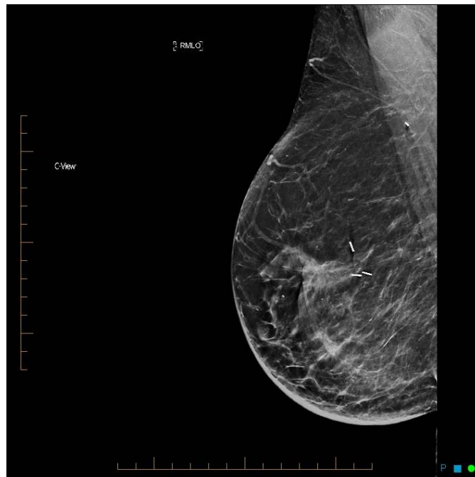
Fig. 1b. SM mediolateral oblique view with metal artefact reduction in the region of a benign surgical scar