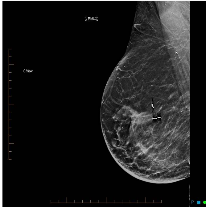
Fig. 1a. SM mediolateral oblique view without metal artefact reduction in the region of a benign surgical scar

lesion quality rating with the software in use highlighting the importance of using this software in routine imaging acquisition.