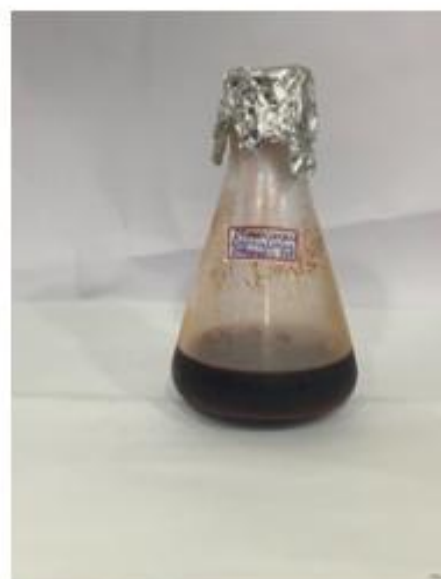
Image 1. Image showing the Synthesis Pterocarpus santalinus ethanolic extract