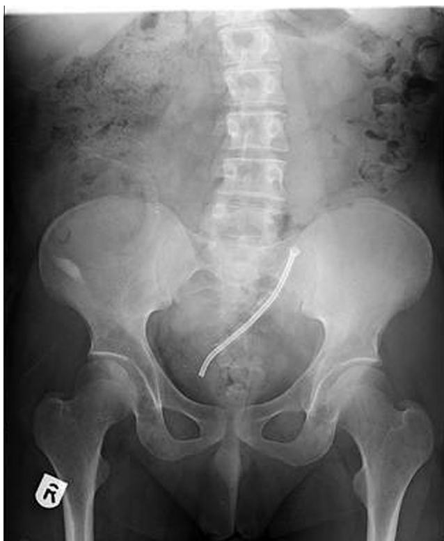
Figure 3 Follow-up X-ray after 27 months showing the position of the Memokath 051® inside the mesh wire stent without any signs of re-encrustation.