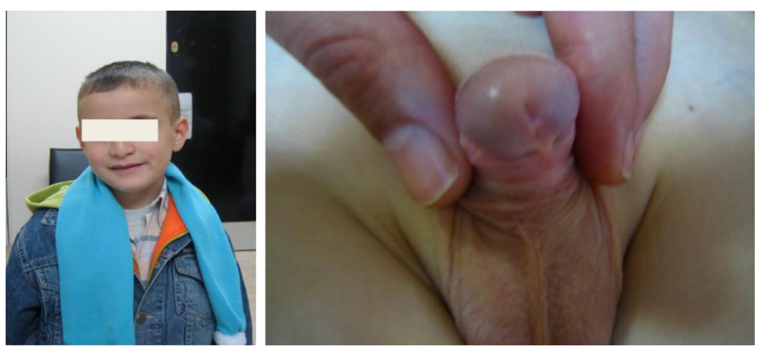
Figure 1 A 5-year-old patient with CAH (46,XX).