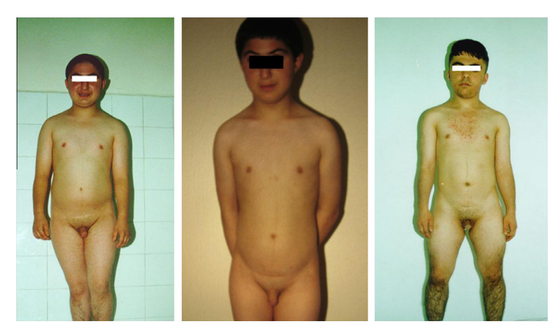
Figure 2 Patients with 46,XX CAH, reared as 'male'.

primary amenorrhoea associated with normal breast development and low or absent pubic and axillary hair. Its presentation can also be with bilateral inguinal hernias during childhood [12]. These individuals are born appearing externally as female, and uniformly raised as females; they are generally satisfied with their female gender and sexual function [13]. This might show the effect of androgen unresponsiveness of the brain, in addition to unambiguous female sex of rearing.