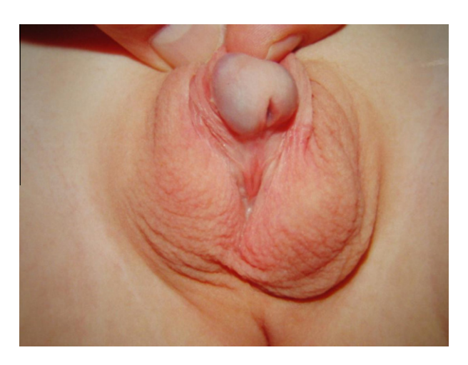
Figure 4 The external genital appearance of a patient with 5-AR deficiency.

gender role and identity, when left without gonadectomy, can undergo virilisation throughout childhood, especially at the onset of puberty. Also, early removal of the testes is recommended, because of the high rate of germ-cell malignancy (28%) [18]. However, with the help of testosterone treatment and corrective surgery, individuals raised as males can show satisfactory male development. Thus, the decision in either direction is still controversial, and there should be a prompt and accurate diagnosis with molecular genetic tests.