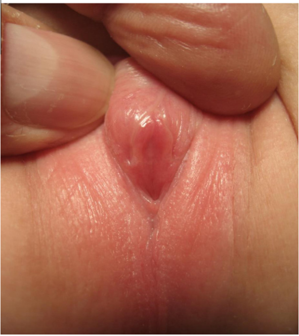
Figure 5 The external genital appearance of a 46,XY patient with POR deficiency.

be assigned as 'male', because of the development of a male gender identity at diagnosis [5,24]. In our study, 49 of 70 patients with f-CAH were reared as female and 21 as 'male'. Only nine of these 'males' could be reassigned as females (mean age at presentation, 7.87 months). Twelve children had to be reared as 'male' (mean age at presentation, 55.8 months) in compliance with the parents' and the study group's decision, and appropriate masculinising reconstructive surgery was undertaken. The difference in the mean age of those reassigned as female and those who remained 'male' was significant (P < 0.001). The parental consanguinity rate among the families was especially high in the 'male' patients, reflecting the influence of the extended family and social factors on the preference for a male gender. In children who were raised as 'male', the decision was strongly influenced by the fear of social stigmatisation.