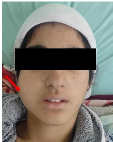
Fig. 1. Clinical picture showing tumefaction of the right parotid

The initial Blood tests found an elevated C-reactive protein CRP 177 mg/dL and neutrophilia 9850 / \mu L. Pus was exuded from right Stensen's duct on compression of the gland externally yielding 3cc of purulent material. Bacterial cultures didn't identify any organism on gram stain and culture. The patient was treated with intravenous antibiotics (amoxicillin/ clavulanate) for 4 weeks then switched to oral antibiotic for 2 weeks. She achieved a total of 6 weeks antibiotic. After discharge, there was a noticeable clinical improvement, biological parameters normalized and abscess disappear on the ultrasound (Fig. 4).