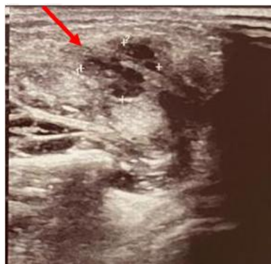
Fig. 2. Ultrasound image showing hypoechoic lesion of the right parotid gland with