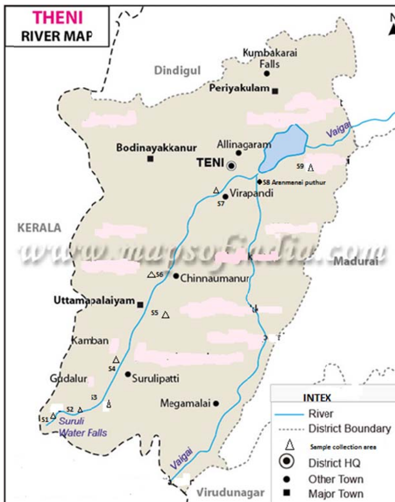
Figure 2. Map of Mullaiperiyar River sampling stations in Theni district. S1: Lower camp; S2: Kullappuram; S3: Karunagamuthan patti; S4: Surulipatti; S5: Uthamapalayam; S6: Chinnamanur; S7: Veerapandi; S8: Aranmanaiputhur; S9: Vaigai dam.