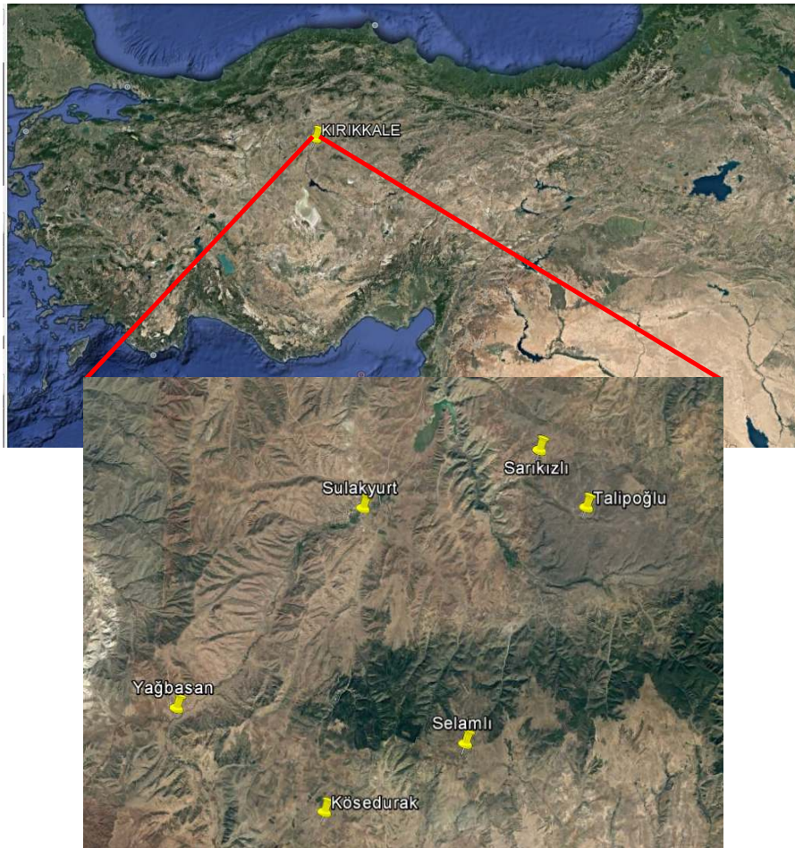
Fig. 1. Location of the studied Pubescent oak populations

For multivariate analyses, variables measured at different scales were standardized by means of Z scores of SPSS to equally contribute to the analysis. Hierarchical cluster analyses, completely based on numerical analysis, are aiming to group objects based on their similarity through different steps to determine consecutive clusters and the distance values (or similarities) of the units to be included in these clusters. Nearest neighbor was used as cluster method. Morphological differences among populations were visualized with both an unweighted pair group method with arithmetic mean (UPGMA) dendrogram based on hierarchical cluster analyses based on Euclidean distances. All statistical analysis was performed by using SPSS program [34].