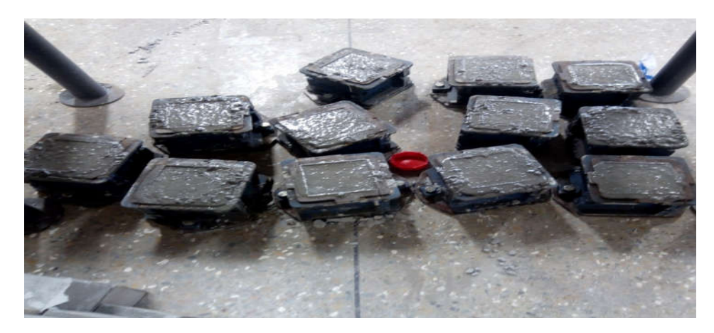
Fig. 1. Concrete cubes in a mould

The slump results obtained were tabulated and compared to various forms of slump such as shear, collapse, true and conclusions were drawn descriptively. Porosity results were tabulated, analysed and used to draw a bar chart. An Engineering software- Sigma Plot 12 was used to process research data. With regards to compressive strength analyses, the mean strength of concrete specimens was computed and presented in tables using Microsoft excel. Data were subjected to oneway ANOVA tests to determine significant difference and variation between results.