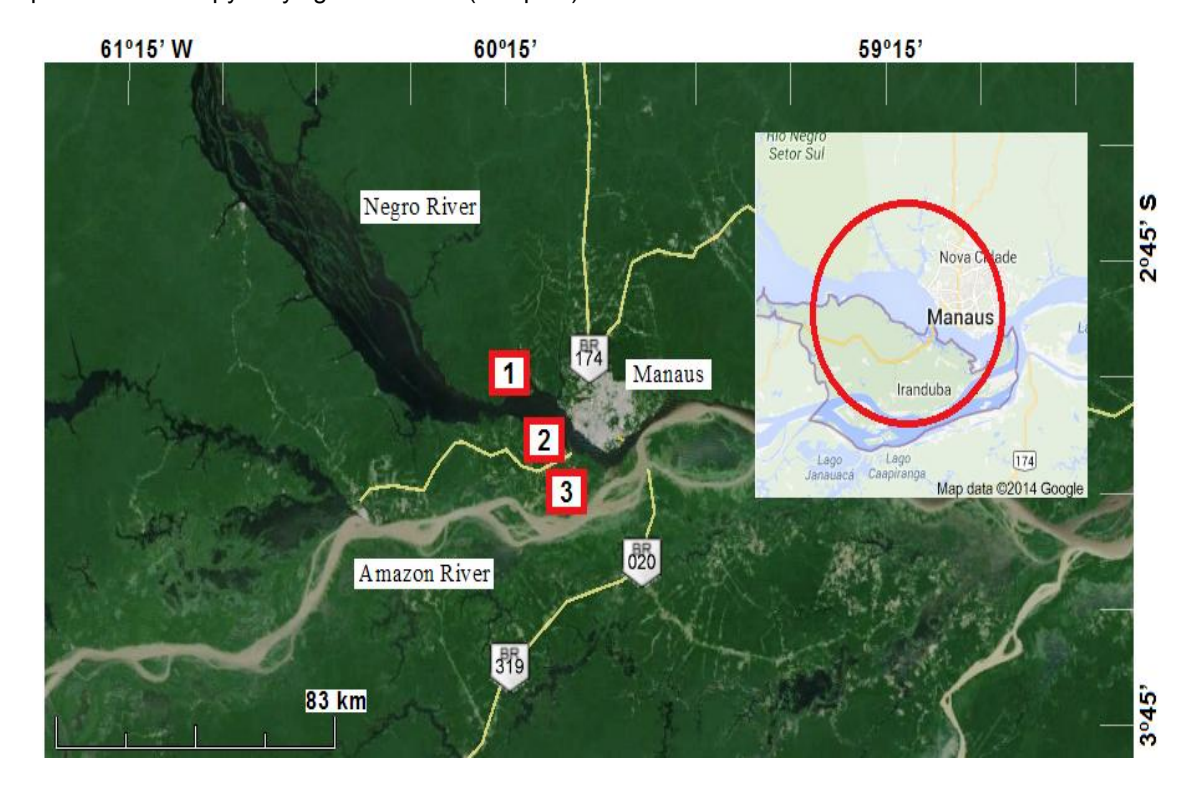
Fig. 1. Study areas in the Amazon River basin, Brazil. Legend: (1) Upland Forest–ULF; (2) Capoeira–CPO; (3) Campina–CAM

to open forest. The area of Capoeira (CPO - site 2 in Fig. 1) usually emerges as a result of opening a forest to extensive farming, grazing, occasional farming or mining, which is later abandoned because the soil has been exhausted or its resources extracted. In the initial stage of regeneration, Capoeira presents numerous grasses and ground ferns, and a few pioneer tree species. Depending on the restoration time, a new patch of forest may emerge with characteristics of primary or secondary forest. The Campina ecosystem (CAM – site 3 in Fig. 1) is characterized by scattered and low vegetation, which occurs in sandy soils of low fertility, especially in the region of influence of the Negro River basin [11], which also occurs in the Amazon River basin. Campina (grassy) vegetation may emerge as a result of forest fires, mainly due to water stress, presenting many fire resistant species. This property of grasslands, which is shared by the typical Cerrado vegetation, renders these landscapes less vulnerable to global warming, but does not make them immune to degradation resulting from human activities.