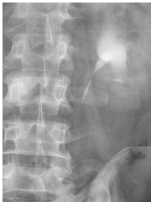
Figure 3 The follow-up IVU, after hormonal treatment, showing an improvement in the obstruction.

We had two patients (70 and 62 years old) who both initially presented with severe constipation. MRI in the first patient showed a huge mass bulging into the rectum. The serum PSA level was 480 ng/mL and limited