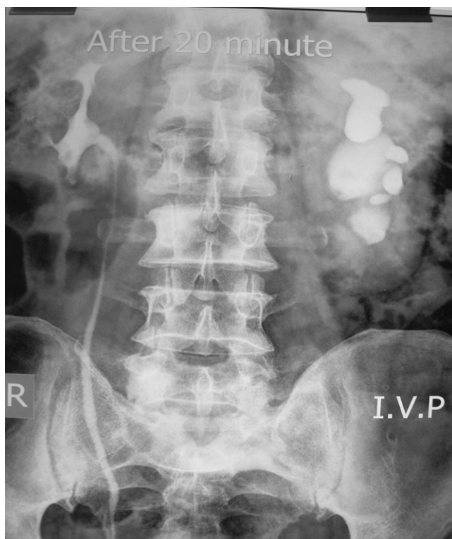
Figure 1 Initial IVU showing the left PUV obstruction.