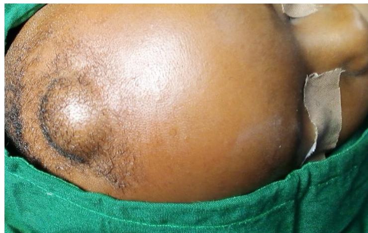
Fig. 3A. Intra – operative picture (before incision)