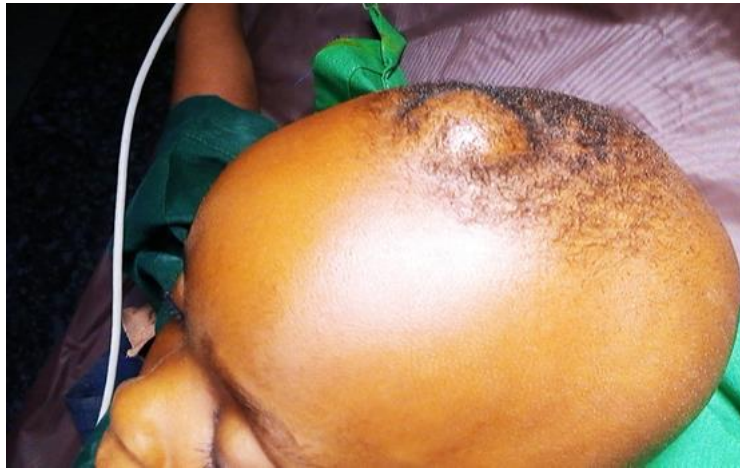
Fig. 2. Pre- operative picture