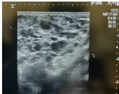
Fig. 2. Vascular malformation and advised MRI with contrast for further evaluation