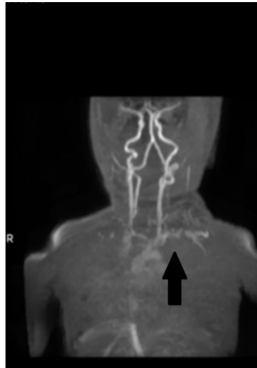
Fig. 4. MRA- reveals possible feeding artery arising from pre-foraminal segment of left vertebral artery (V1 segment)