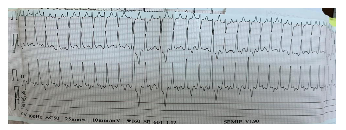
Fig. 1. Electrocardiogram showing a supraventricular tachycardia

The patient subsequently had presented a cardiorespiratory arrest that was not recovered after 30 min of cardiopulmonary resuscitation.