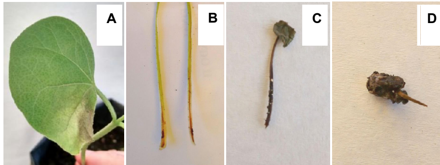
Fig. 1. Cotton seedlings infected with Fusarium oxysporum f. sp. vasinfectum after the transmission test: (a) wilt of cotyledonary leaf (b) Darkening of the vascular tissues (c) Dead seedlings (d) Dead seedling, right after radicle emission

The maximum Fov transmission rate from the seed to the seedlings were of 89.0, 71.0 and 64.0% for BRS 286, Topázio cultivars and Mocó variety, respectively (Fig. 2). The high percentage of Fov transmission in the cultivar BRS 286 occurred due to its susceptibility to the Fusarium oxysporum f. sp. vasinfectum complex. In a similar study, Araújo et al. [7] verified the maximum transmission rate of different Fov isolates, of approximately 50.0% in the cotton cultivars FM 966 and IAC 20-233.